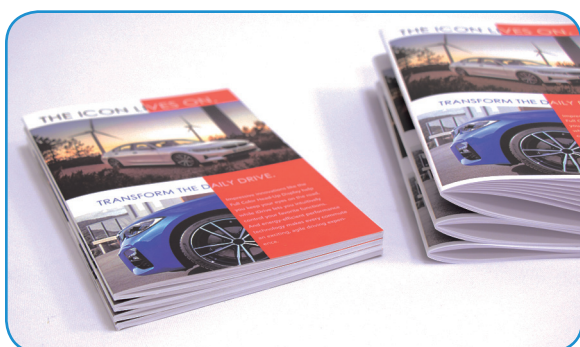
Squared booklets (left) are easier to stack and require less room to pack, store, and ship than unsquared booklets (right), with the added capability of printing on the spine

Multiple Languages Available: Control panel offers guidance in a variety of languages