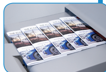
Outfeed conveyor keeps finished booklets in a neat, sequential order