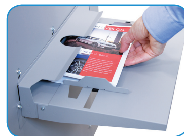
Hand-feed booklets or run in-line with a digital printer

*Squaring and trimming is subject to the number of sheets and paper weight.