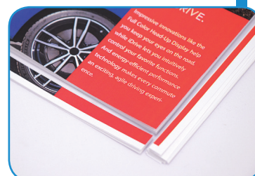
Three-sided full-bleed trimming for professional output