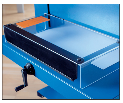
For protection, the blade will not move until this safety cover is placed in the down position.