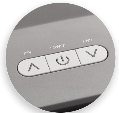
Convenient, easy-to-use controls for simple operation.