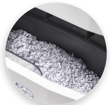
Security Level P-4 for the destruction of confidential documents.