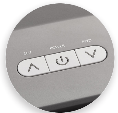
Convenient, easy-to-use controls for simple operation.