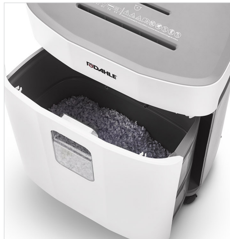
The 7 gallon waste bin features a clear window to view shred level and is easy to empty.