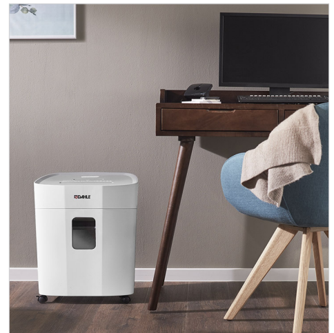
Compact size makes it easy to place the shredder wherever you need it most.