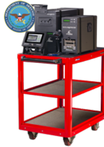
Data Eliminator Cart Package (RCC-1XT5SSD IRONCLAD shown)

The PD-5 IRONCLAD operates as a stand alone unit or as part of a complete degauss and destroy system when paired with our TS-1XT NSA-listed degausser, HD-3XTL high-volume degausser, or HD-2XT high-speed degausser. Add a cart, case, or workstation.