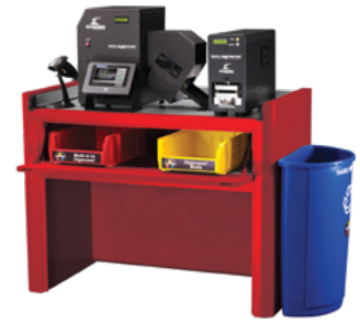
Degauss Destroy Recycle Workstation (DDR-35SSD IRONCLAD shown)