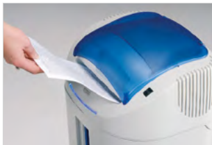
24 HOUR CONTINUOUS DUTY MOTOR

1. Shreds up to 14 sheets of paper at a time by inserting them into the wide and convenient throat on the front.