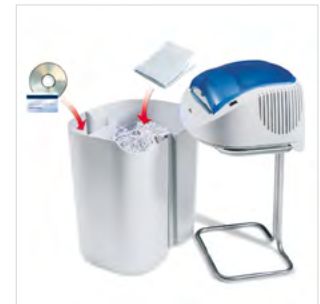
TWO INTEGRATED REMOVABLE BINS

3. Lift the cover and throw a crumpled sheet of paper into the machine. Close the lid and the special "Throw and Shred"