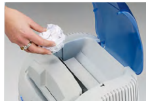
THROW AND SHRED SYSTEM

2. Shred CDs/DVDs/Credit cards inserting them into the second throat. "Mobile Protection Security" System which stops the machine when the lid is raised.