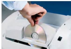
TWO SEPARATE SETS OF CUTTING KNIVES

1. Shreds up to 14 sheets of paper at a time by inserting them into the wide and convenient throat on the front.