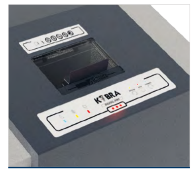
Touch-screen operating panel: controls are activated by simply touching the intuitive control panel with LED indicators.

SSDs (also with metal casing), smartphones, SIM cards, USB drives, flash memory, IC chips, Credit Cards with chips, PC Boards, CD/DVD/BD.