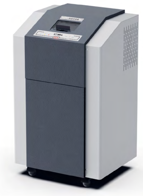
TRADE AGREEMENT ACT (TAA) AND BUY AMERICAN ACT COMPLIANT.