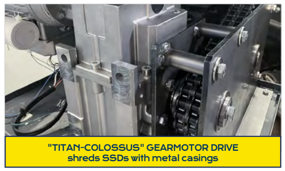
The Kobra DIGITAL-PRO is eqipped with the "Titan-Colossus" gearmotor drive specially\,designed\,heavy\,duty\,cutting\,knives\,with\,unmatched\,power\,to\,shred large quantities of: SSDs (also with metal casings), smartphones, SIM cards, USB drives, flash memory, IC chips, Credit Cards with chips, PC Boards, CD/DVD/BD.