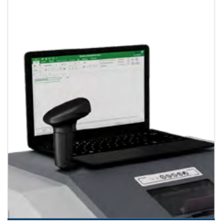
LOG MANAGEMENT SYSTEM (OPTION): allows to scan and automatically store into a computer barcode serial number of the device being shredded, keeping track of day and hour (barcode reader included).