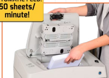
Up to 400 sheets paper tray for auto-feed system: 50 sheets per minute shredding speed