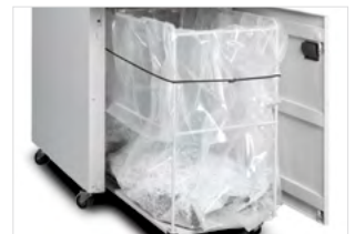
ADJUSTABLE REMOVABLE TROLLEY

It eliminates the need to manually lubricate the unit, ensuring maximum reliability, efficiency and capacity.