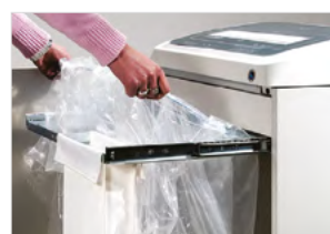
TWO DISTINCT BINS

Two entry openings and two sets of cutting knives for the separate insertion and shredding of paper and CDs/DVDs/credit cards.