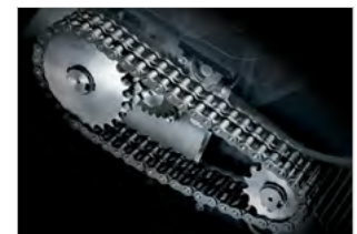
SUPER POTENTIAL POWER SYSTEM

Two integrated and removable bins to separate shredded paper from plastic shreds.