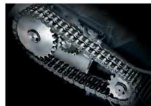
SUPER POTENTIAL POWER SYSTEM

Two entry openings and two sets of cutting knives for the separate insertion and shredding of paper and CDs/DVDs/credit cards.