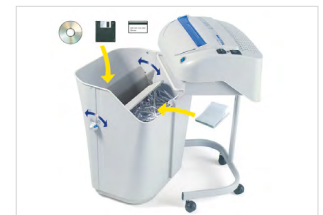
CONVENIENT REMOVABLE WASTE BIN

by pressing the Turbo switch the shredding capacity of the machine is increased by 30%.