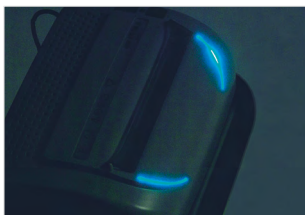
24 HOUR CONTINUOUS DUTY MOTOR

Motor thermal protection. Continuous duty motor, no overheating and no duty cycles. Optical illuminated indicators for power saving stand-by mode.