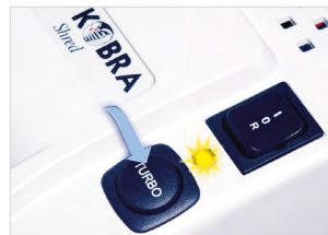
TURBO BOOST SYSTEM

Heavy duty chain drive with steel gears which offer reliability and resistance to wear. Carbon hardened steel cutting knives unaffected by staples and clips.