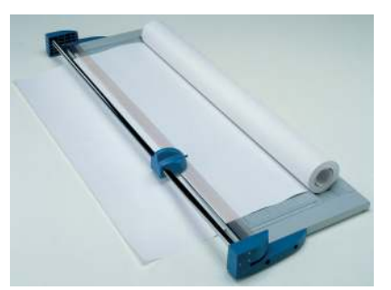
Convenient built-in paper rolls housing for easy cutting operations of large sizes of continuous paper