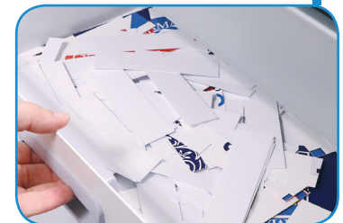
Waste bin collects paper scraps and is easy to empty