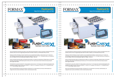
2-up 8.5" x 11" Brochures Optional FC-XL20 - 11" Cassette