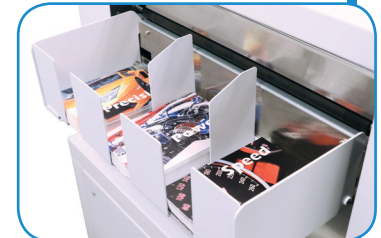
Adjustable catch tray accommodates a variety of finished card sizes