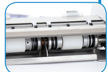
Heavy-duty cutting cassettes are interchangeable in seconds