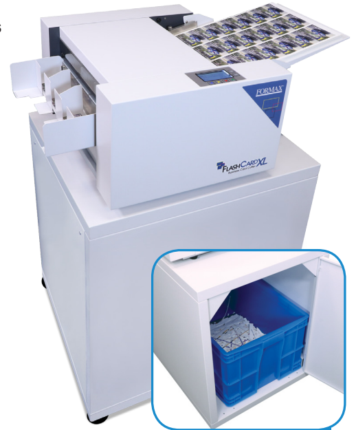
Shown on optional cabinet with casters and high density waste bin