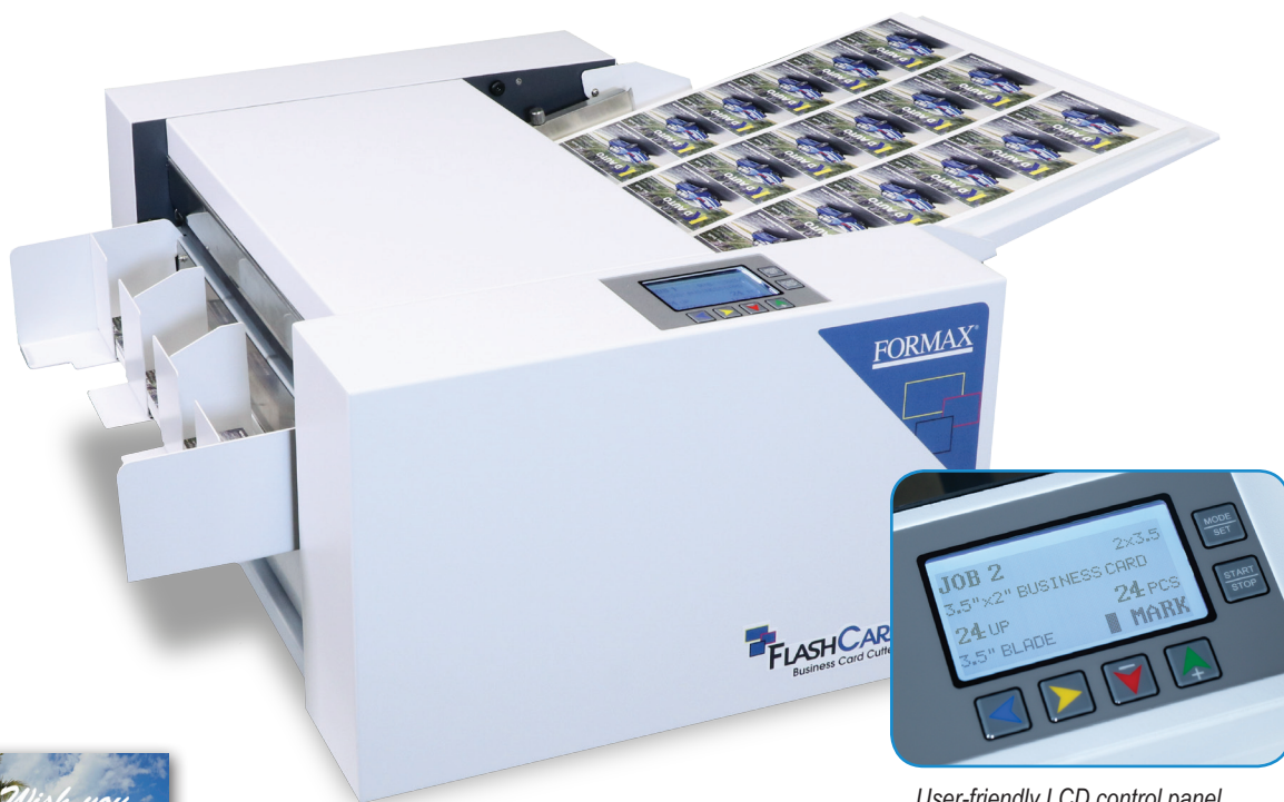
User-friendly LCD control panel