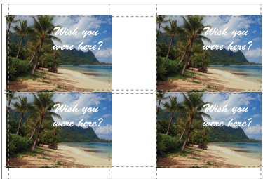
4-up 5" x 7" Postcards Optional FC-XL30 - 5" Cassette