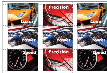
9-up 3.5" x 5" Postcards Standard FC-XL05 - 3.5" Cassette