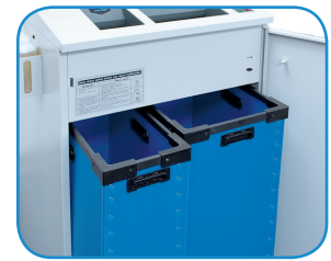
Separate Waste Bins for Paper and Optical Media