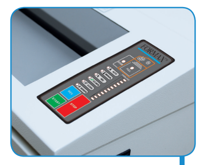
LED control panel with Load Indicator and ECO Mode