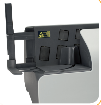
Easy-to-use support arm extends to hold large envelopes