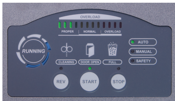
LED control panel with visual load indicator

The FD 8906CC offers unmatched automated features through its LED control panel. The easy-to-read Load Indicator assists operators in determining how close they are to the maximum shred capacity to avoid jams and provide optimal efficiency. Operators can select from two modes of operation: Auto Start/Stop or Manual. Auto Start/Stop mode utilizes optical sensors which detect paper and start/stop operation automatically. Manual mode provides non-stop operation for shredding small sized paper or films. The Safety Key Lock prevents unauthorized use of the shredder.