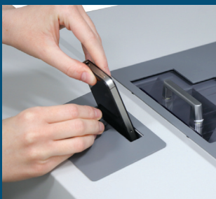
Mobile Phones and SSDs