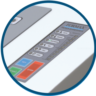
User-Friendly Control Panel: ECO Mode, Door Open Sensor, Reverse, Bin Full Indicator

The Formax FD 87SSD OnSite Multimedia Office Shredder is designed for the modern technological world. It easily shreds mobile phones, SSDs, mini tablets, USBs, and more. The FD 87SSD is whisper-quiet and operates on standard 120V power , making it ideal for the office environment. It features a user-friendly LED control panel , a sturdy all-metal cabinet on casters , solid steel cutting blades , and a rugged chain-driven motor . The separate enclosed infeed options allow users to safely shred a variety of media up to 6.5" wide. With its commercial-grade construction and features, the FD 87SSD sets the standard for safety and security.