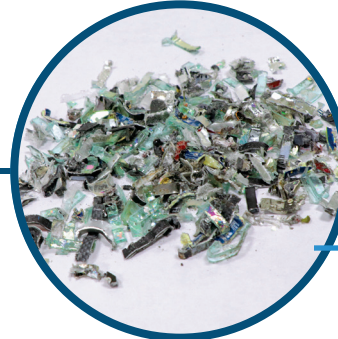
Media Shredding: Shreds media into random pieces up to 0.60". Perfect for security and peace of mind