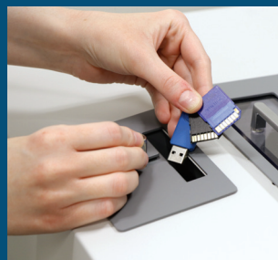
USBs and SD Cards