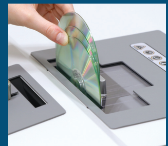
CDs and DVDs