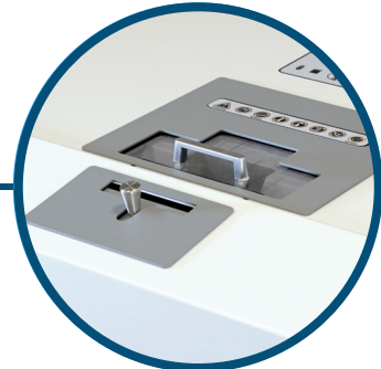
3 Dedicated Infeed Options: Safely feed various size media through the appropriate infeed, up to 6.5" W