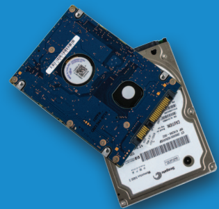
Laptop Hard Drives