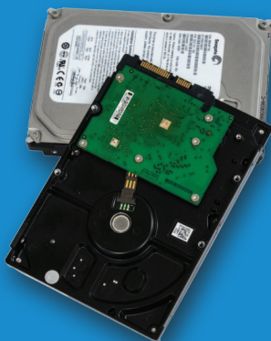
Desktop Hard Drives