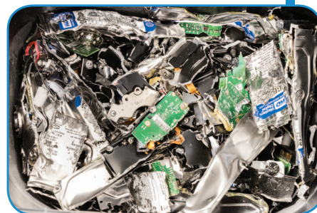
Particles fall into the waste bin for easy storage and disposal