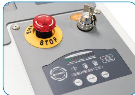
LED control panel, safety key lock and large emergency stop button