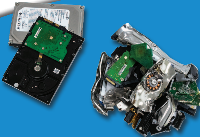
3.5" HDD Hard Drives Shredded with the FD 87HDS-R