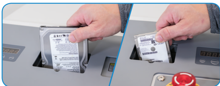
Separate shredding chambers sized for 3.5" HDD and 2.5" SSD & HDD hard drives, each with sliding metal safety shields and resettable LED counters