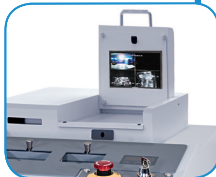
Recording System internal and external cameras to monitor input and output of drives for optimal security