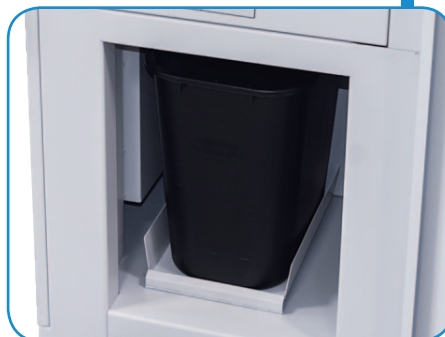
Rugged molded plastic waste bin for convenient storage and disposal