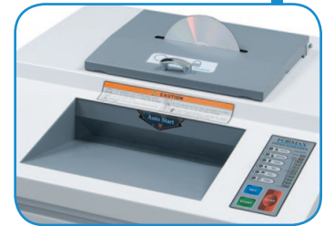
Two dedicated feed openings for paper, CDs/DVDs, USB thumb drives