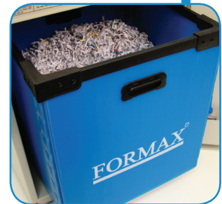
Lifetime Guaranteed Heavy-Duty Waste Bin