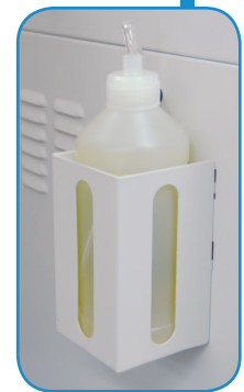
Optional EvenFlow™ Automatic Oiling System