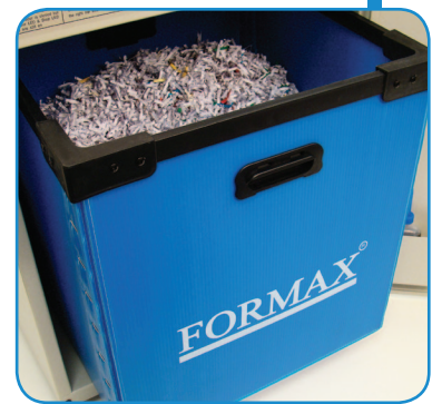
Lifetime Guaranteed Heavy-Duty Waste Bin