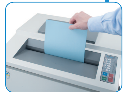
Standard Infeed accommodates up to 24 sheets at once