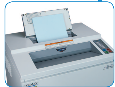
Dedicated AutoFeeder holds up to 175 sheets