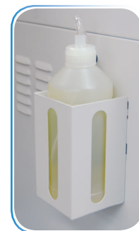
EvenFlow™ Automatic Oiling System

*Capacity varies depending on paper and power supply