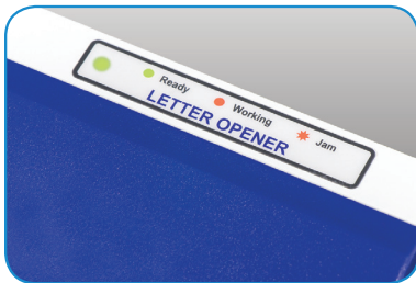
LED status indicators