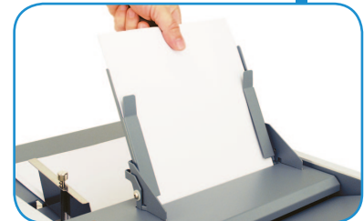
Optional Multi-Sheet Feeder