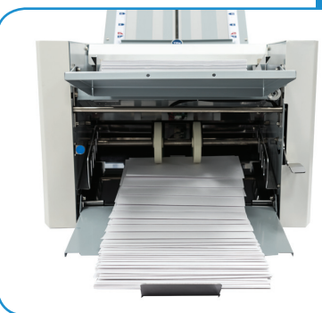
Output conveyor with adjustable stacker wheels for neat, sequential stacking