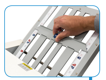
Clearly marked fold plates and quickrelease fold stops make setup a breeze

Pre-Marked with 4 Standard Folds: Letter, Zig-Zag, Half, and Double Parallel, in 11", 14" and 17" sizes Three-Tire Friction Feed System: Accurately pulls paper into the fold rollers Quick-Release Fold Stops: Simply pull the knob, slide the fold stop to the correct setting, and release AutoBatch: Process a specific number of sheets with a pause between sets, for easy unloading Fine-Tuning Knobs: Located on the end of each fold plate to allow for precise adjustments