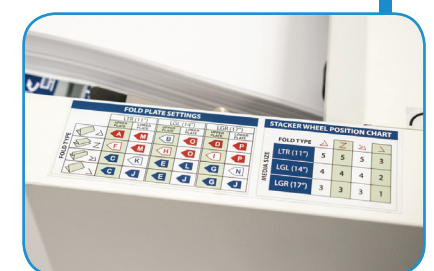
Fold guide icons match those on the fold plates, for intuitive, easy setup