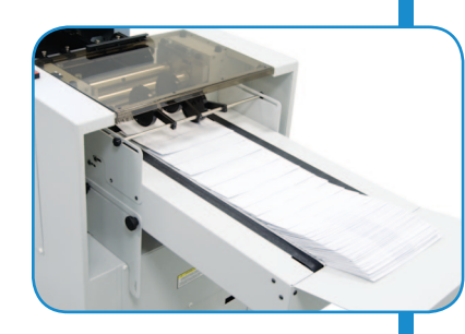
24" outfeed conveyor helps keep forms in a neat order after processing