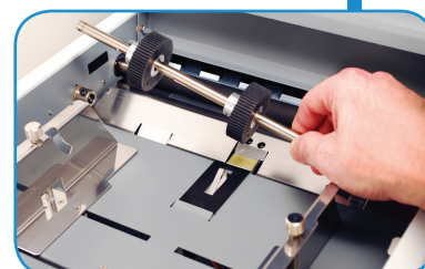
Removable Feed Wheels