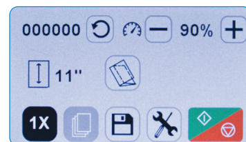
Large color touchscreen control panel

The AutoSeal® FD 2056 is a fully automatic pressure sealer which provides the ultimate high-volume tabletop solution for processing pressure sensitive one-piece mailers. Designed with ease of operation and efficiency in mind, the FD 2056 features a full-color touchscreen control panel, and automatically detects and adjusts for 11", 14" and 17" forms. It offers 5 pre-programmed standard folds for even panel C, V, Z and uneven/eccentric C and Z folds. It also has the ability to store up to 35 custom fold settings with the simple touch of a button.