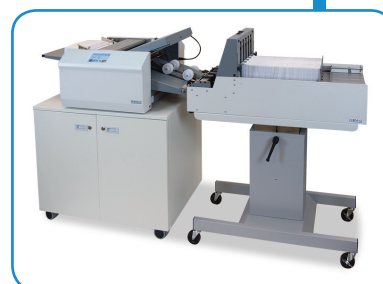
FD 2056 in-line with optional V-Stack36i Vertical Stacker, stand and cabinet