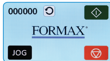
Touchscreen control panel is graphics-based making it easy for anyone to use