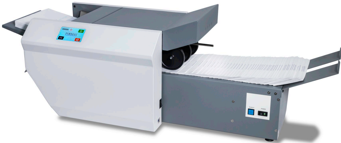
FD 2036 shown with optional conveyor

The FD 2036 AutoSeal ® is a user-friendly high-volume solution for processing one-piece pressure sensitive mailers. The color touchscreen control panel uses internationally-recognized symbols in place of text, and includes a six-digit resettable counter. With a speed of up to 11,000 forms per hour, hopper capacity of up to 350 forms, and the ability to process forms up to 14" in length, the FD 2036 enables operators to complete daily processing jobs with ease.