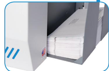
Standard Catch Tray