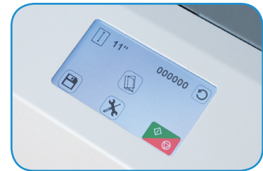
Touchscreen control panel is graphics-based making it easy to use