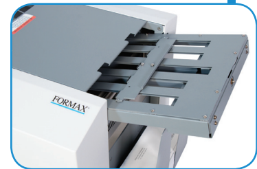
Automatically adjusting fold plates make for quick and easy setup