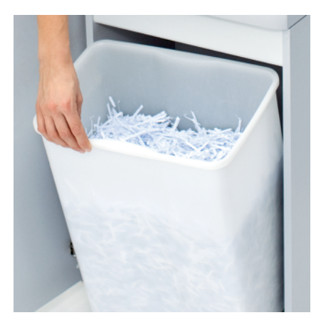
ENVIRONMENTALLY FRIENDLY BIN

Electronically controlled, transparent safety shield keeps fingers out of the feed opening.