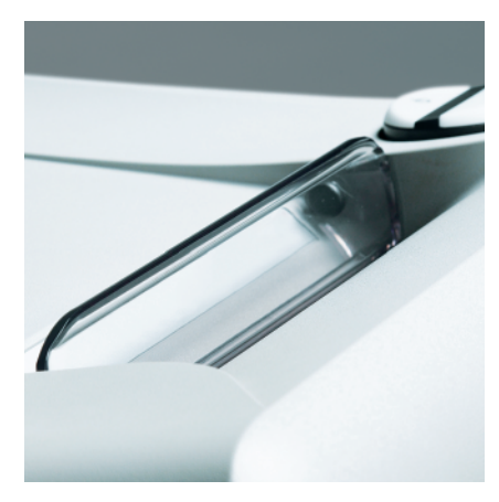
PATENTED SAFETY SHIELD

Multifunction control element uses optical signals to indicate operational status and functions as an emergency stop switch.