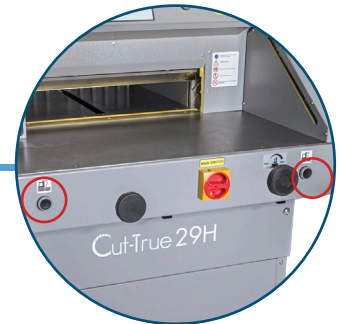
Two-Hand Operation Automatically engages clamp and blade keeping hands away from the cutting blade