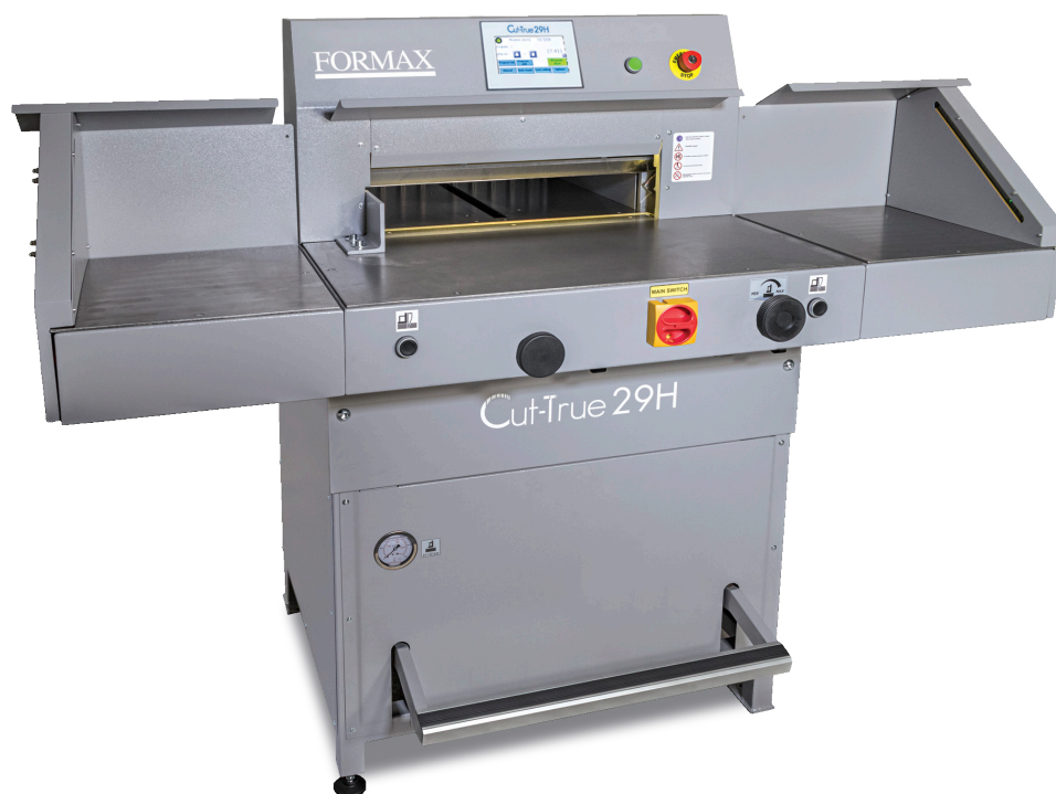
Shown with optional wide side tables