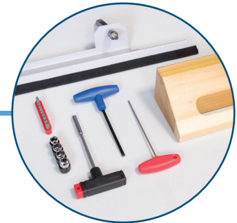
Blade Change Safety Tool Kit Change blades safely and easily, and make adjustments