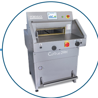
Standard Model Compact model without optional side tables