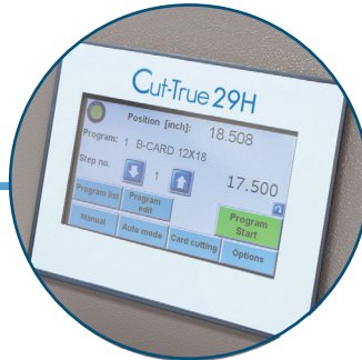
Touchscreen Control Panel Allows for programming up to 100 jobs and 100 steps