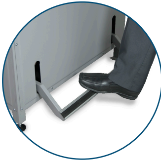
Foot Pedal Pre-Clamp Holds paper to check alignment prior to cutting