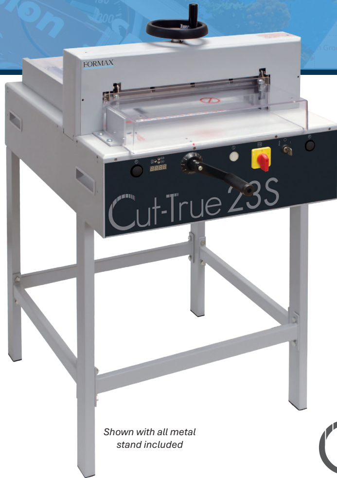
Shown with all metal stand included