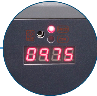
LED Back Gauge Display Get a precise cut using standard or metric settings