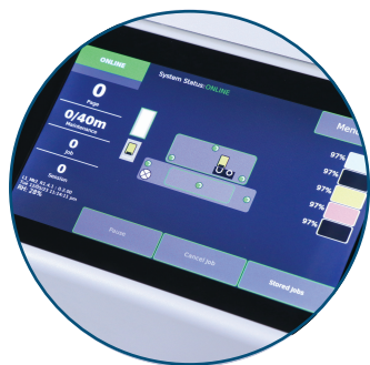
Color Touchscreen Control Panel Recall stored jobs, monitor status, check ink levels, perform maintenance operations

The ColorMaxLP3 produces brilliant full-color labels from a compact on-demand unit. Its high-speed standard Unwinder/Rewinder System easily handles a variety of substrates for continuous roll-to-roll production at up to 60 fpm. The Memjet® print head features 70,400 inkjet nozzles for print resolution up to 1600 x 1600 dpi . High-capacity 250ml ink tanks allow for longer uninterrupted print runs. User-friendly features include an intuitive 7" color touchscreen with job storage, 10-second warm start , and front access to ink cartridges .