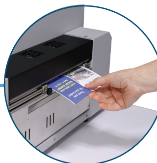
Two Operating Modes Continuous roll-to-roll for production, integrated cutter for short-run jobs