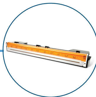
Memjet® Inkjet Print Head Stationary print head with no moving parts features 70,400 inkjet nozzles