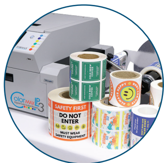
Compatible Across Substrates Works easily with paper, polyester, polypropylene and vinyl label stocks