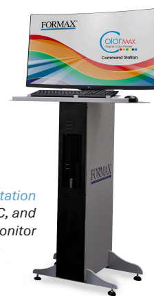
Optional CCS8 Command Station Workstation, PC, and 32" curved monitor