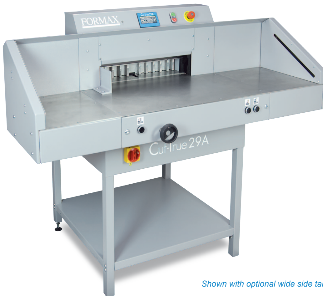
Shown with optional wide side tables

The Formax Cut-True 29A Electric Guillotine Paper Cutter offers precision cutting for paper stacks up to 20.5" wide. User-friendly, intuitive features include a touchscreen control panel, automatically-adjusting back gauge and the capacity to program up to 100 jobs/100 cuts . An infrared light beam safety curtain provides safety and convenience as it shuts down operation if the light plane is interrupted.