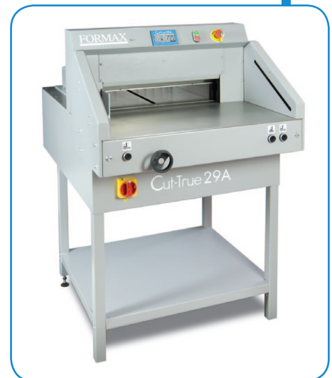
Standard model, without optional wide side tables

Formax – New Hampshire, USA www.formax.com