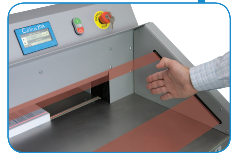
Infrared Safety Curtain shuts down operation if the beam is interrupted