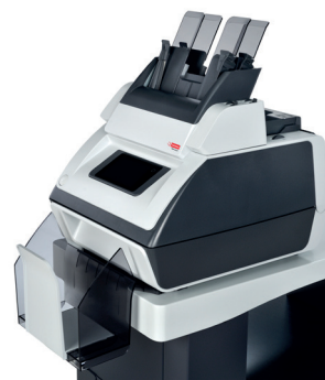
TSI-2.0 S 2 STATIONS