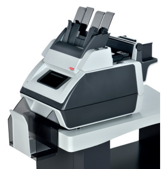
TSI-2.5 S 2.5 STATIONS