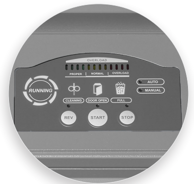
LED keypad with easy-to-use controls for simple operation.