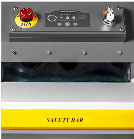
Emergency stop button, safety bar, and key lock ensure safe shredding.

The PowerTEC® 929 Industrial Shredder is precision engineered to shred high volumes of paper, binders, and optical media with ease.