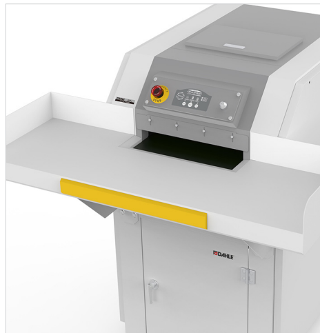
Built-in work tray holds high volumes of paper and media to make shredding easier.