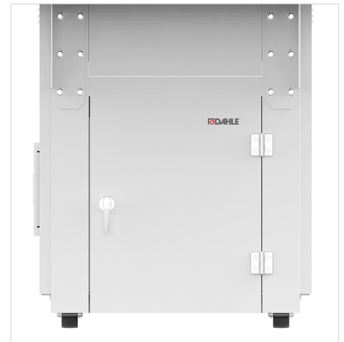
The extra-large roll-out bin can hold up to 120 gallons of waste.