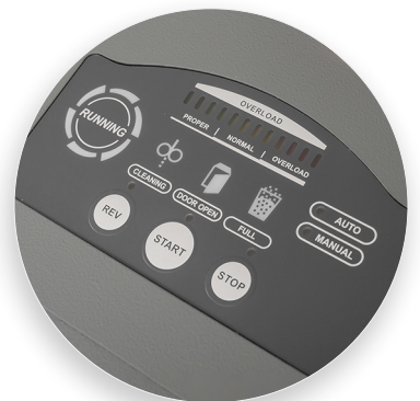
LED keypad with easy-to-use controls for simple operation.