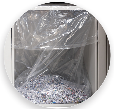
High capacity shredder can hold up to 68 gallons of waste in roll-out bin.

The PowerTEC® 909 HS Hopper Shredder is a high capacity machine for destroying sensitive information on paper and optical media. It features a powerful chain driven motor, an automatic EvenFlow Lubricator, and simple push button operation. This shredder is rated for Security Level P-3 destruction and holds up to 68 gallons of waste. It's precision engineered and guaranteed to provide many years of trouble-free operation.