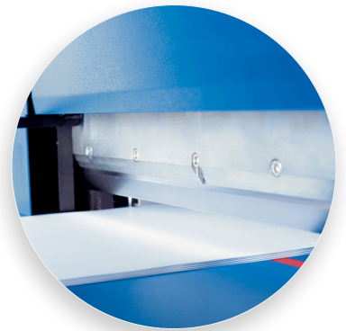
Effortlessly cut through stacks of paper with the machine ground steel blade.

The Dahle 846 Professional Stack Cutter cuts up to 500 sheets of paper with minimal effort. Designed for precision, it features a machine ground blade for smooth trimming, built-in safety features, and a spindle-driven backstop for accuracy. This German engineered cutter is designed for durability and is ideal for print & copy shops, corporate printing departments, and custom printers.