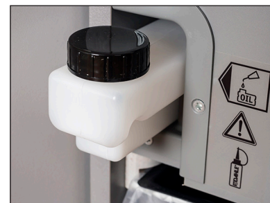
The EvenFlow Lubricator provides continuous lubrication and ensures peak performance.