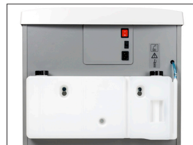
The 1 gallon EvenFlow Lubricator provides continuous lubrication for peak performance.