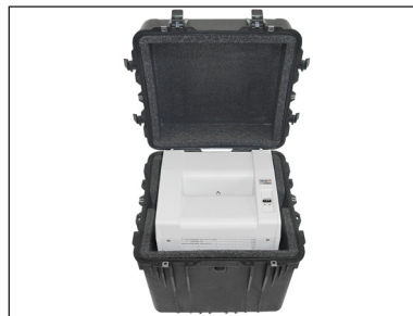
This shredder comes equipped with a high impact plastic mobility case for easy transit.