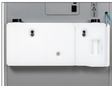
The 1 gallon EvenFlow Lubricator provides continuous lubrication for peak performance.

Fewer things are more frustrating than a paper jam. With automatic jam protection, this shredder prevents those annoyances. If sheet capacity is exceeded, the motor automatically stops and reverses to push the paper back out. This prevents a jam and makes it easy to re-feed fewer sheets.